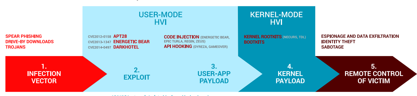
UM HVI is strongly isolated (enforced by hardware) and provides generic detection mechanisms

HVI already detects and blocks famous targeted attacks including Carbanak, Turla, APT28, NetTraveler or Wild Neutron without knowing beforehand the actual vulnerabilities used by the hackers.